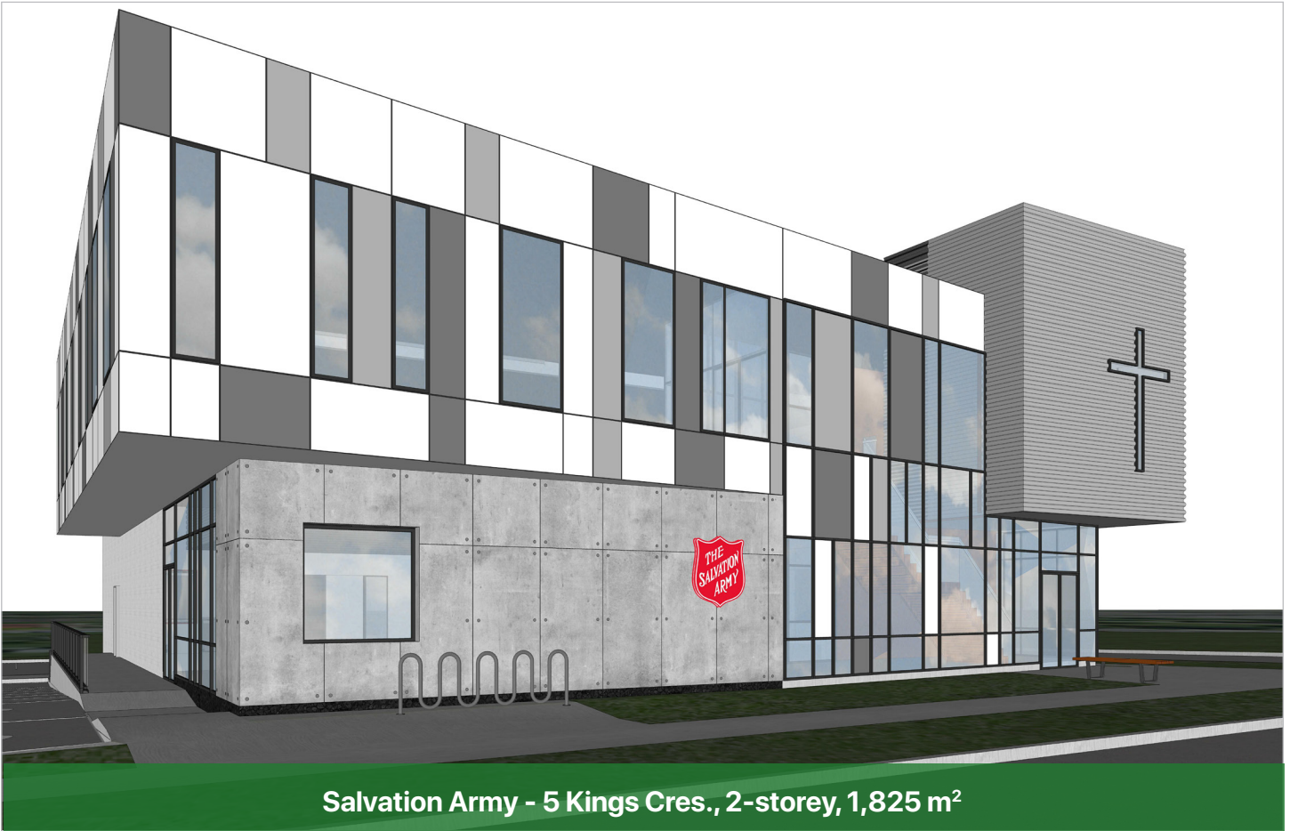
Salvation Army - 5 Kings Cres., 2-storey, 1,825 m 2