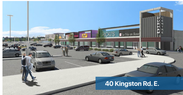
40 Kingston Rd. E.