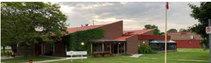
St. Andrew's Community Centre

Start: Spring 2023 Completion expected: Spring 2024