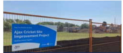
Ajax Cricket Club pitch

Start: Spring/Summer 2023 Design completion expected: Fall 2023 Anticipated construction: Fall 2024