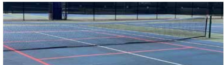
Ajax Community Centre

The Town continues to support the growth of the pickleball community! Two additional courts have been painted for pickleball at the Ajax Community Centre (ACC), with more expected in other wards across the Town.