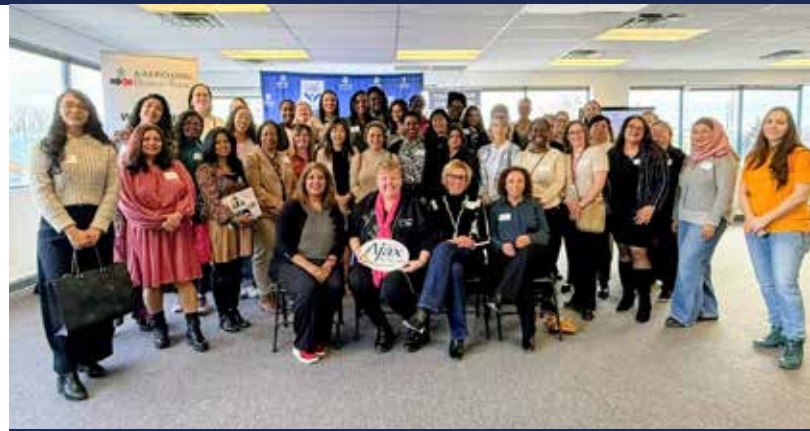
APBOT Coffee Connects

Thank you for continuing to engage, share your experiences and speak up. Your input shapes my work, and I remain committed to representing Ward 2 with integrity, care and determination.