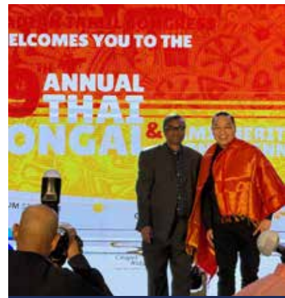
Celebrating Thai Pongal and Tamil Heritage Month