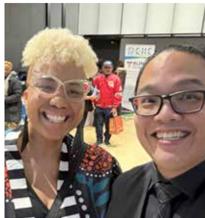
Celebrating Black History Month