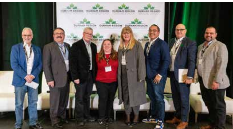
Representing Ajax with Durham Region Mayors at the Durham Region Home Builder's Association Panel