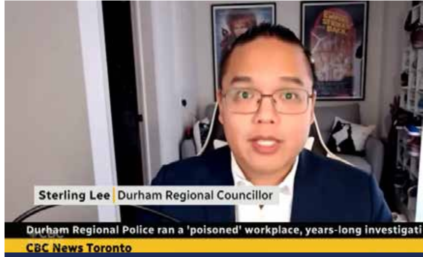
Interview with CBC regarding alleged DRPS Misconduct