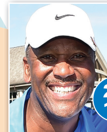
Joe Carter World Series Hero