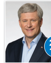
The Rt. Honorable Stephen Harper 22nd Prime Minister of Canada