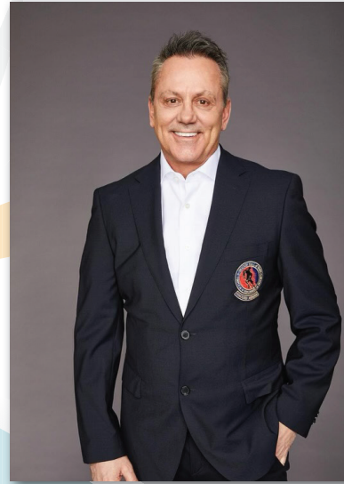
Doug Gilmour Canadian Former Professional Ice Hockey Player

Doug Gilmour, born on June 25, 1963, in Kingston, Ontario, Canada, is a former professional ice hockey player widely regarded as one of the greatest centers of his era. Known for his exceptional skill, tenacity, and leadership, Gilmour had a highly successful career spanning over two decades.