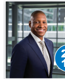
Masai Ujiri President, Toronto Raptors Founder, Giants of Africa