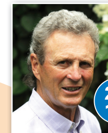
Paul Henderson A True Canadian Hero