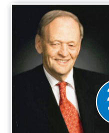
The Right Honourable Jean Chretien