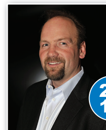
Wendel Clark Former Captain of the Toronto Maple Leafs