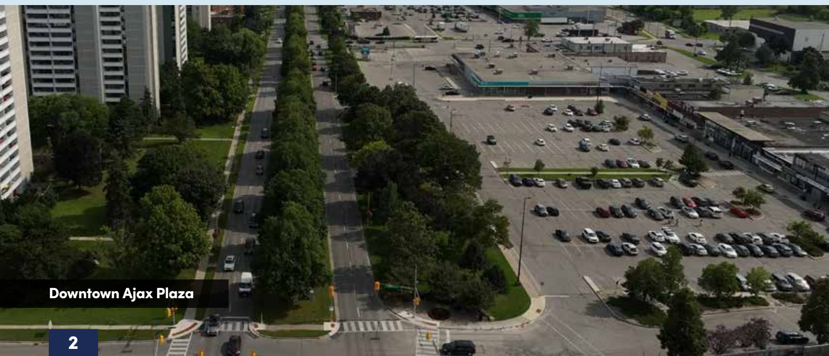
Downtown Ajax Plaza

The Region is starting the process for a Community Mental Health Crisis Response Service to be able to meet the growing need for specialized services.