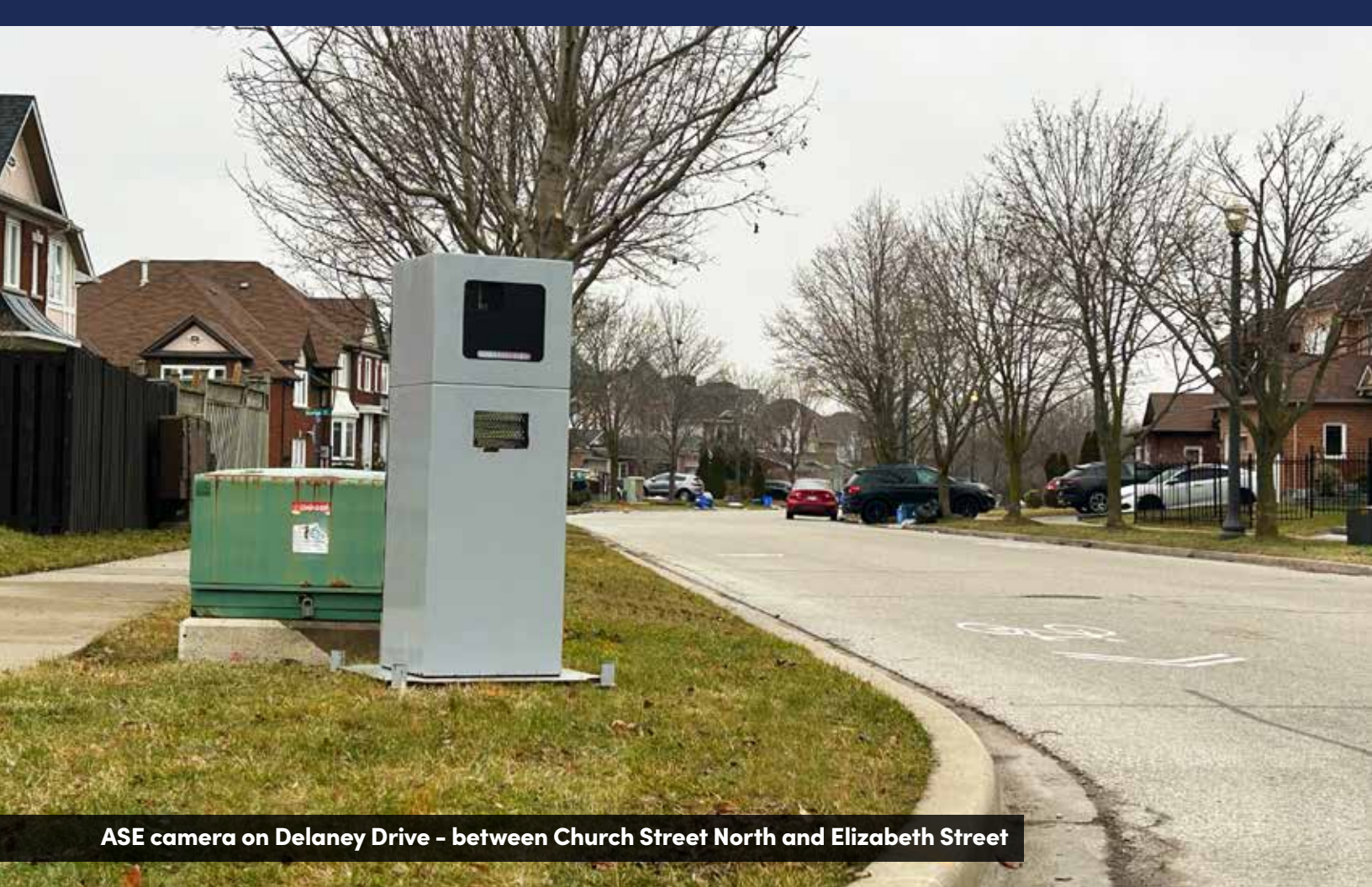
ASE camera on Delaney Drive - between Church Street North and Elizabeth Street