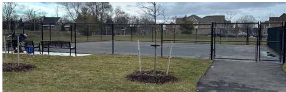
Completed – new pickleball court at St. Andrew's Centre