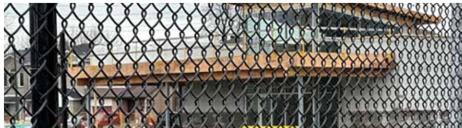
Cricket facility – expected to be completed early summer